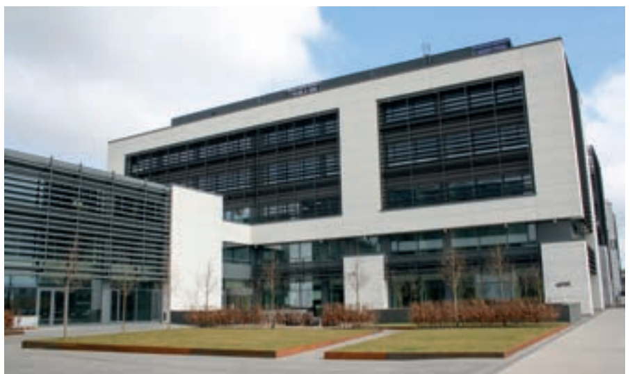
University of Luxembourg – Esch/Alzette – Belval