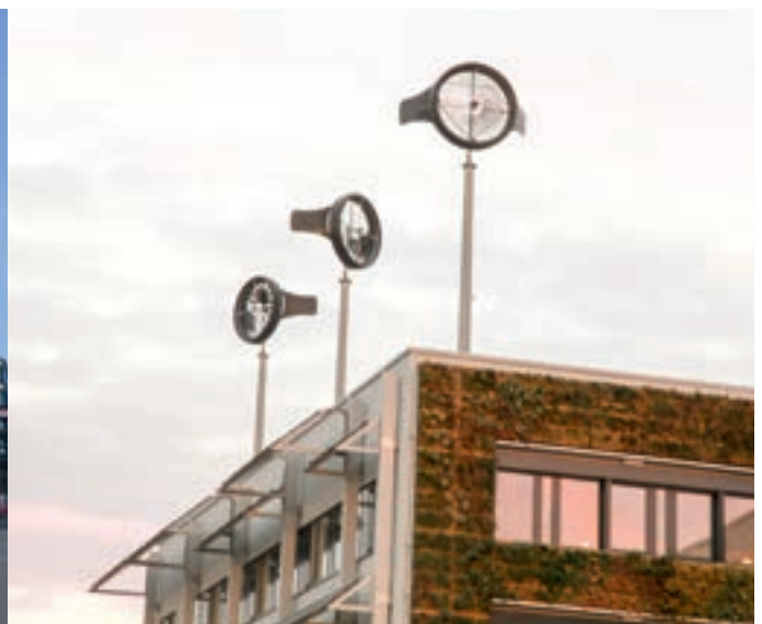
Solarwind – Windhof