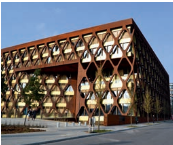
KPMG Luxembourg – Kirchberg