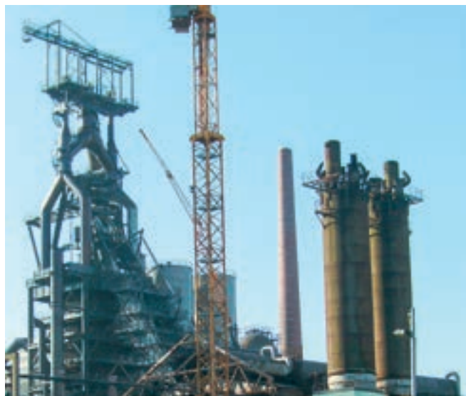
Cité des Sciences